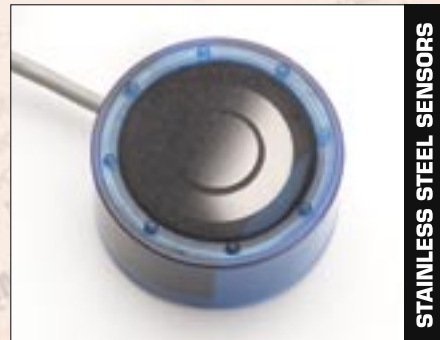
STAINLESS STEEL SENSORS