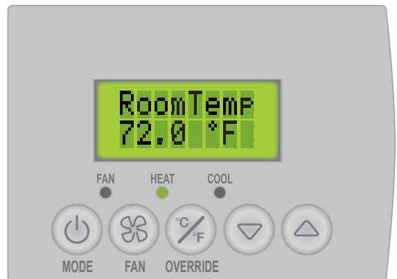
Hotel and Lodging Application