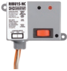
Functional Devices, Inc. A600D 2006

Enclosed Relay 10 Amp SPST-N/C + Override with 10-30 Vac/dc/120 Vac Coil