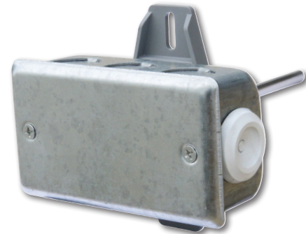
Pierceable Knockout Plug installed in a J-Box (top) and in the open port of a BAPI-Box Crossover Enclosure (left).

When installed in the open port of the BAPI-Box 4 Enclosure, the Pierceable Knockout Plug increases the enclosure rating from IP10 to IP44. When installed in the open port of the BAPI-Box Crossover enclosure, the Pierceable Knockout Plug increases the enclosure rating from IP10 to IP44.