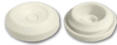
Top and bottom view of a Pierceable Knockout Plug

Pierceable Knockout Plugs are available for the open port in the BAPI-Box Crossover and BAPI-Box 4 Enclosure, as well as the non-threaded ports in the BAPI-Box, BAPI-Box 2 and Junction Box and enclosures. The plugs will also work in panels with a metal thickness of 0.118" or smaller.