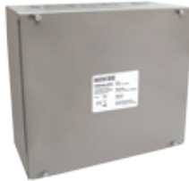
Shown With Cover