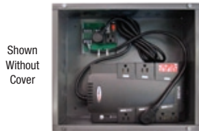
Shown Without Cover