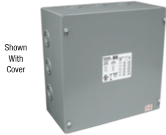
Shown With Cover