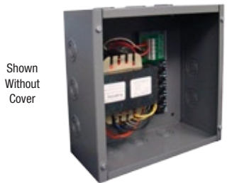
Shown Without Cover