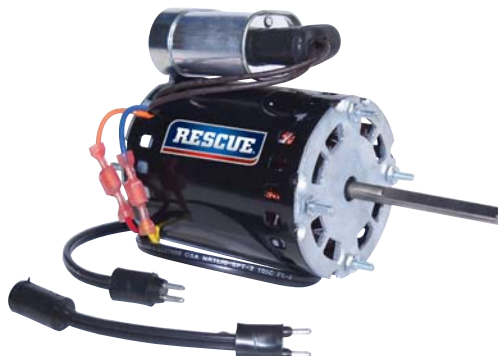
Remove first section for narrow plug (pat. pend.) used in Larkin® products