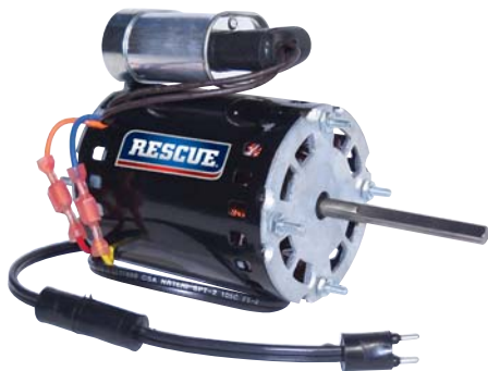
Set up for wide plug used in Bohn® products