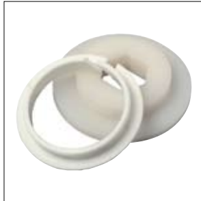
Two-piece bearing for long life and quiet operation.