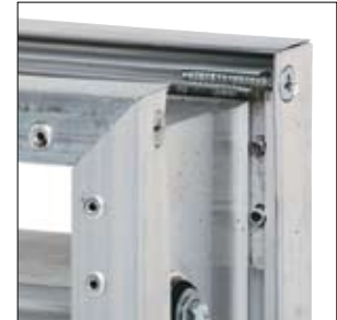
Durable construction — riveted and screwed corners.