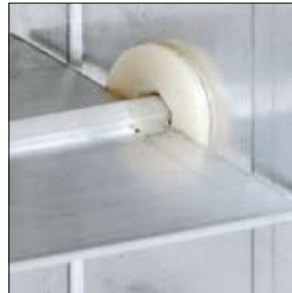
Parallel blade with extruded lip for low leakage.