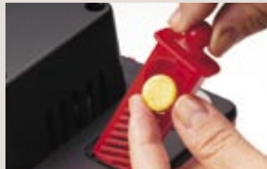
Pan Pill Dispenser

An elastomeric motor mounting gasket dampens vibration.