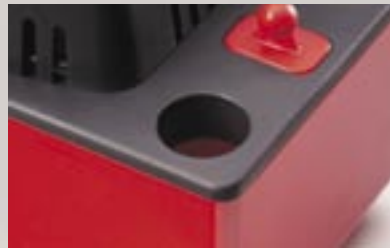
Four Inlet Holes

A float manufactured from foamed polyethylene is a simple, chemical and environmentally resistant, long lasting float. Rather than mold a trapped air float from a material that sinks, or use an expanded polystyrene (EPS) float, the DiversiTech float simply floats.