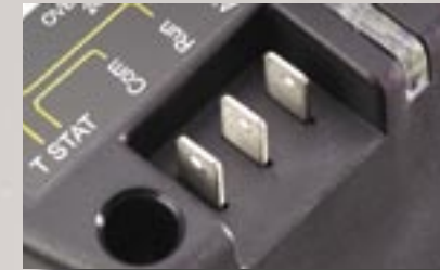
Overflow Safety Switch

Red, yellow, and green indicator lights readily show the pump status. Green for power applied, yellow for pump running, and red for high level alarm.