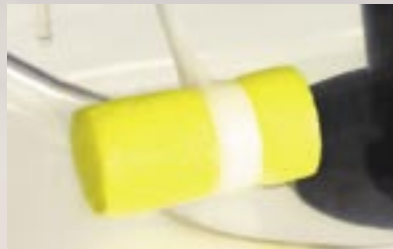
A Float that Floats

1/4" quick connect terminals provide easy connection to the built-in overflow switch. Three terminals are provided allowing the installer flexibility to connect air-handler shut-down and optional alarm as needed. Switch features SPDT isolated contacts ready for connection to building automation systems.