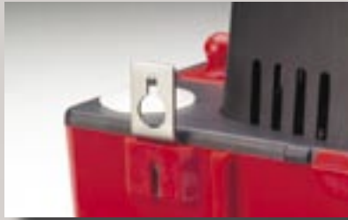
Metal Hang Tabs

Shatterproof stainless steel hang tabs have hole-and-slot design for easy mounting. Tabs are located on convenient 8" centers.