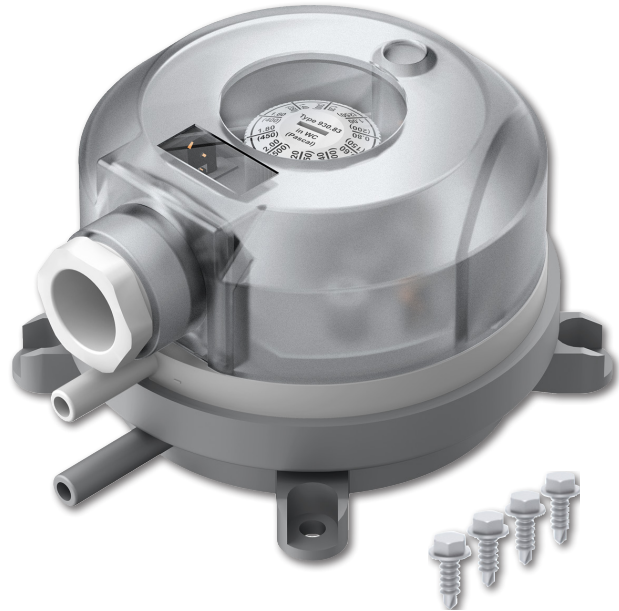
Beck Adjustable Pressure Switch