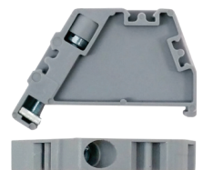
ADIN35ES Pair of End Stops for 35mm DIN Rail